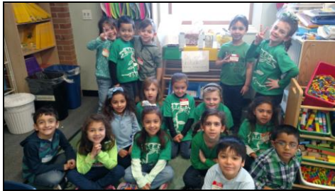
Kindergarten working on their STEM project, Hibernation Station