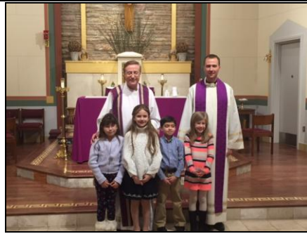
2nd graders after their First Reconciliation.

St. Rose students participated in Career Day by learning about different careers from our parents and people from the community.