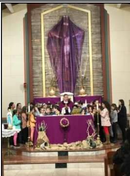
Second graders at Mass before rehearsing for their First Holy Communion.