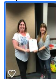
Our Grand Prize winner takes home a Cricut Explore Air 2. One happy scrapper wins a free night at The Hyatt House.