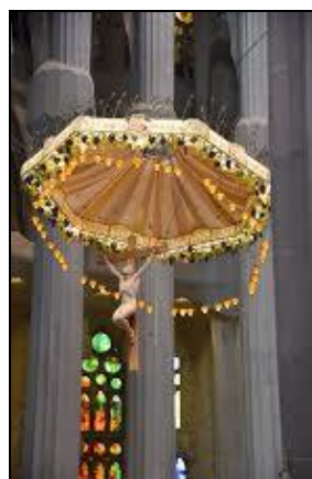
Beautiful hanging crucifix inside the Basilica in Barcelona, Spain.