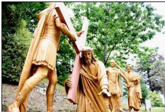
Another one of the amazing life size stations of the cross in Lourdes, France.