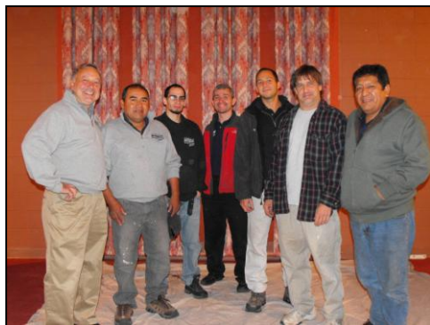
A team from the Peragallo Organ Company taking down the organ from Emmanuel Presbyterian Church, Whippany.

We look forward to seeing you in class!!!