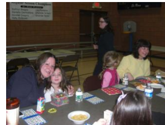
For Catholic Schools Week the children invited their special person for snacks and bingo.