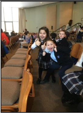
St. Rose students in grades 3 and 4 competed in the Gifted & Talented Brain Bowl.