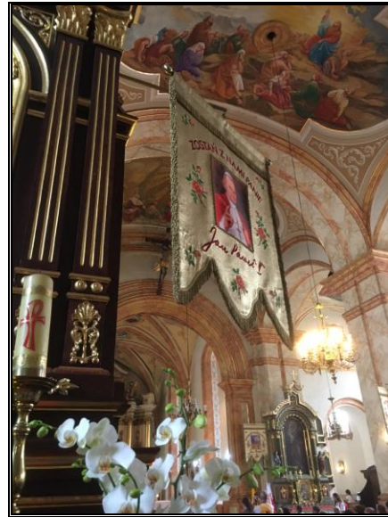
Our Lady of Perpetual Help, Wadowice, Poland, home parish of St. Pope John Paul II. He served as an altar boy here in his youth.