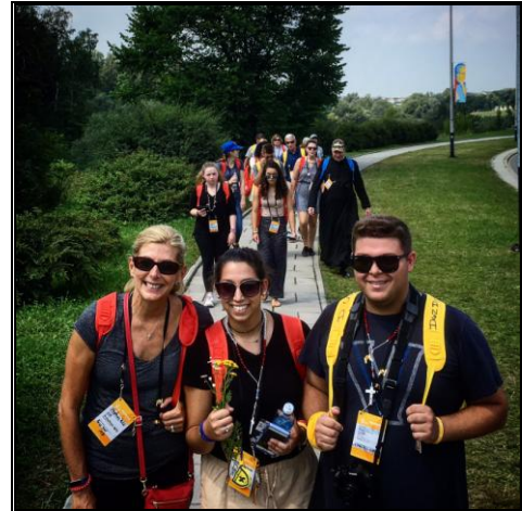
St. Rose of Lima WYD pilgrims on pilgrimage walk in Krakow, Poland..