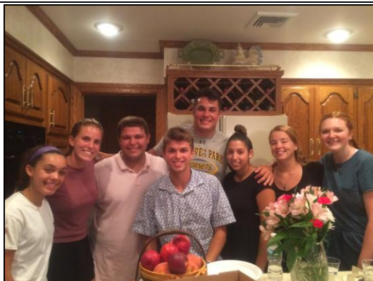
Some of the youth of our parish and our World Youth Day Pilgrims gathered for a WYD reunion and Mass on August 16th. Memories and fellowship were shared

Dear children, please remember your daily prayers and to visit Jesus weekly in the Holy Eucharist. If you want to keep your friendship with Jesus strong and growing, you need to visit with Him (Mass and Eucharist) and talk to Him (prayer).