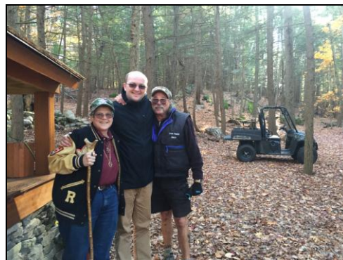
In The Woods