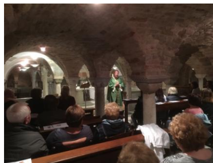
Mass in a chapel at Saint Marks Basilica in Venice.