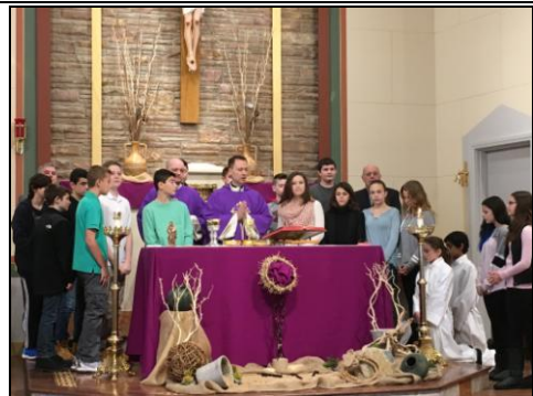
Seventh grade Leaders of Prayer

Former St. Rose Academy 2nd graders, now attending various Catholic Schools who made First Reconciliation.