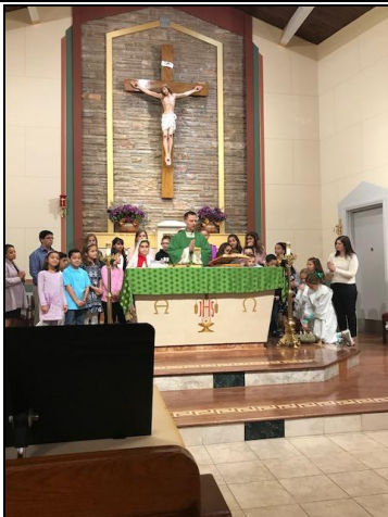
Fifth grade and second grade Leaders of prayer on the altar.