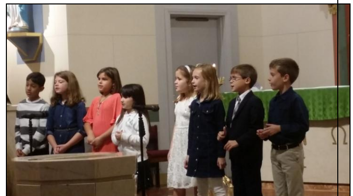
Part of our new Music Program.

Please join the O.F.S. (Secular Franciscan) for prayer, reflection, sharing and then social after the 9:00 Mass on Saturday, November 18. Please Come and See!