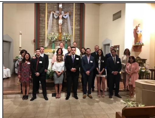
Congratulations to our newly initiated Catholics and their sponsors.