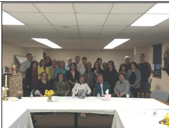
The bearevment group completed their session with a closing Mass and dinner.